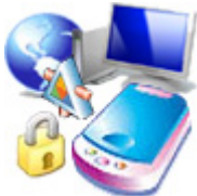
EDM.NET Smart Client